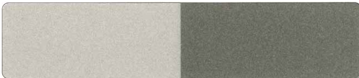
Glare Shimmering Nova Silver GL-9091B Size( \mu m) 15 - 90