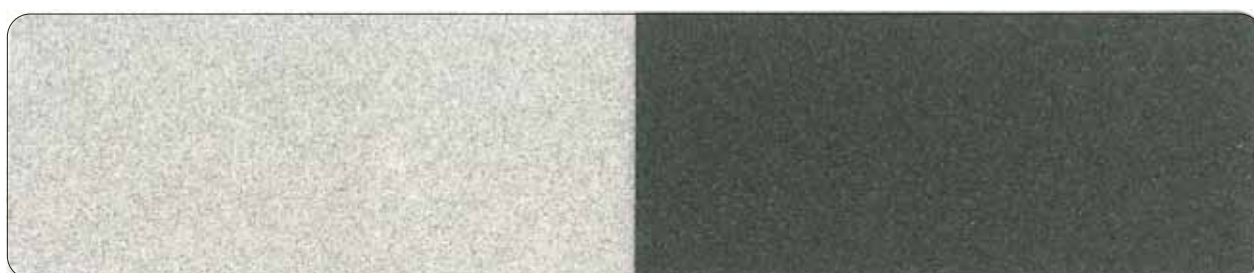
Glare Crystal Nova Silver GL-9091P Size( \mu m) 30 - 180