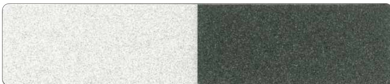
Glare Super Nova Silver GL-9095G Size( \mu m) 30 - 250