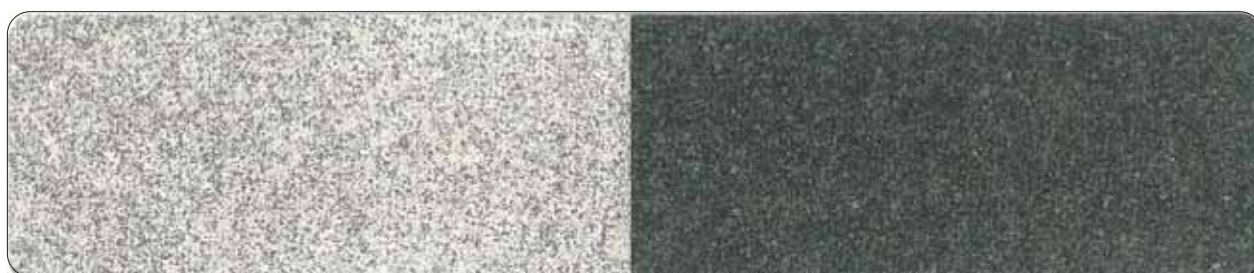
Glare Ultra Nova Silver GL-9091H Size( \mu m) 60 - 600